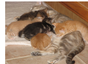
This is my last litter, SNS will help me