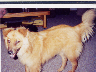
After four litters I am finally free!

SNS continues to participate in the Pima Alliance of Animal Welfare (PAAW) so that we can share resources and create programs for the benefit of all the animals in the County and to work interdependently. For example, a food bank for pets has been started by one of the member organizations; this enhances the service we can provide to our SNS clients.